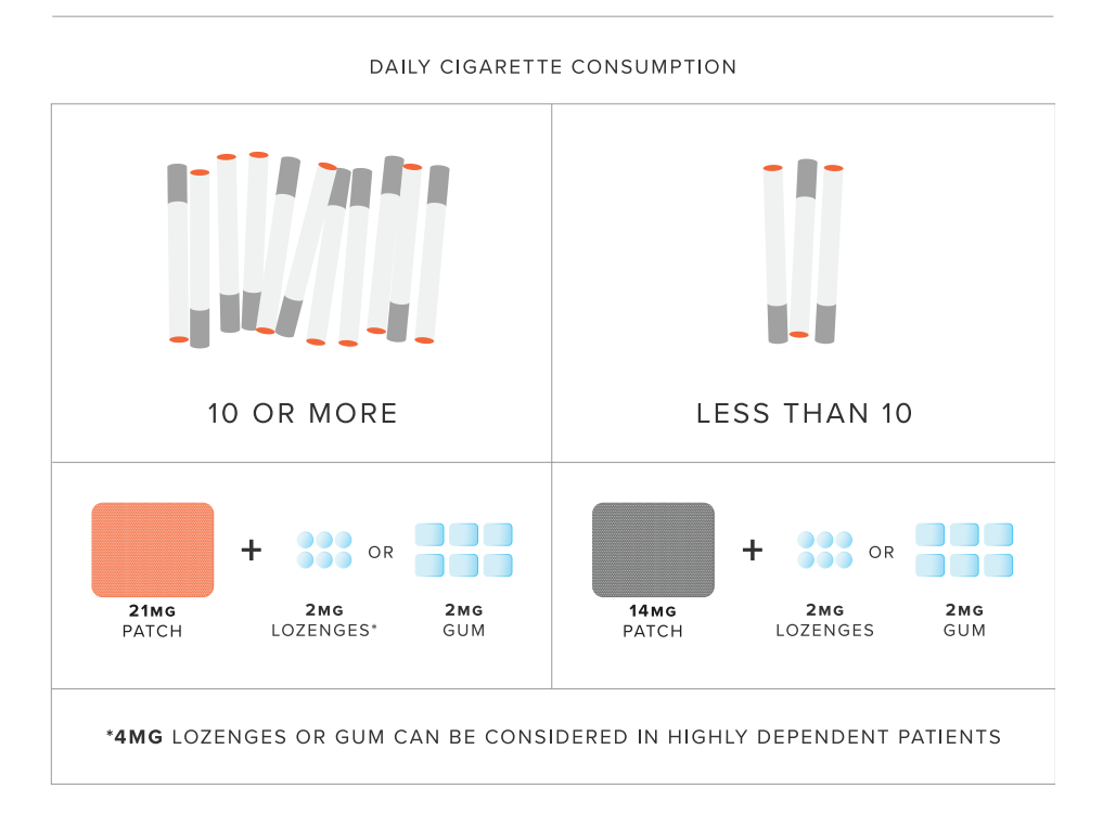
FIGURE 2. COMBINATION NICOTINE REPLACEMENT THERAPY (NRT) DOSING AND ADMINISTRATION