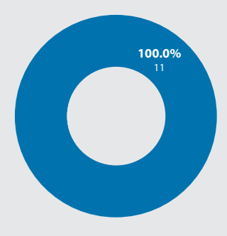
Puerto Rico Veteran Suicides