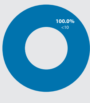
U.S. Territories Veteran Suicides